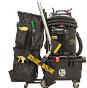
Convenient trash and supply bag cart options.

Daily Floor Cleaning Restroom Cleaning Stripping Waxed Floors Degreasing Kitchens Spill and Flood Pick-up