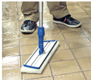
Rapidly spread solution across floor with the Ergo Speed Spreader.