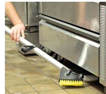
Vacuum under fixtures, shelves and seating with the versatile vacuum wand.